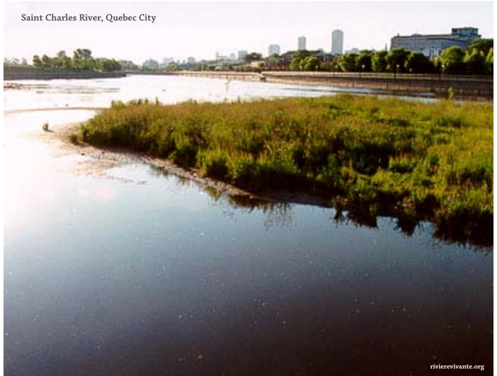
Saint Charles River, Quebec City