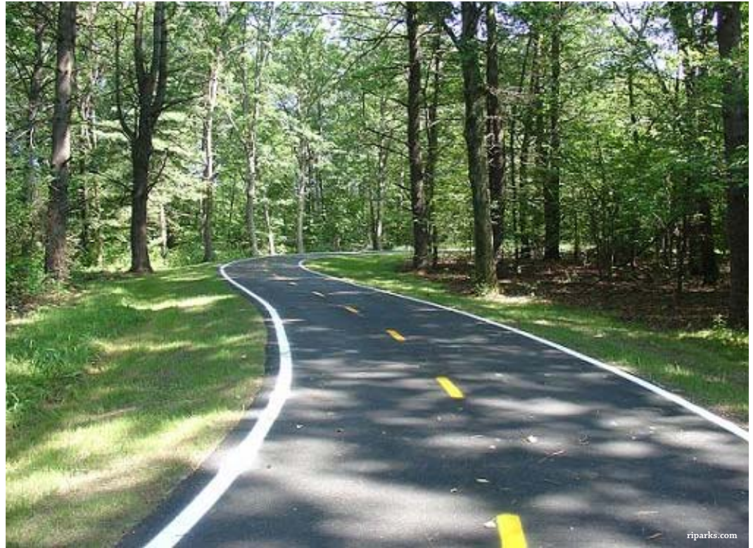
WE’VE BEEN HEARING MORE AND MORE ABOUT THE ENVIRONMENT, PERSONAL HEALTH AND FITNESS, THE PRICE OF GAS...PEOPLE ARE NOW THINKING SERIOUSLY ABOUT NOT DOING ALL TRIPS BY CAR BUT DOING SOME BY BICYCLE.

Another round of public sessions is planned for the fall, when a more specific network of cycling paths will be introduced for feedback. By this time next year, committee and council will have a report with recommendations on implementing the cycling master plan. NRU